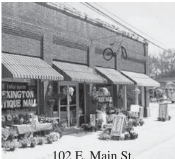
102 E. Main St. Lexington, GA 30648 Contact: 706-347-1052

We're located just 15 miles east of Athens, on Hwy 78 across from the Oglethorpe County Courthouse.