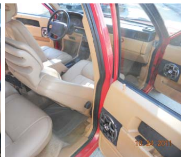
New Sound System